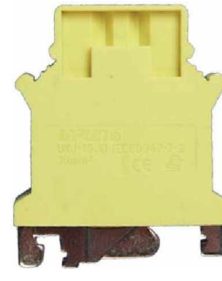
Terminal Width 12.2mm