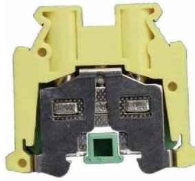
Terminal Width 8.2mm