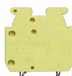
Terminal Width 4.2mm