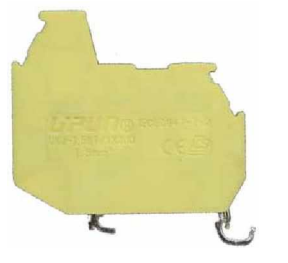
Terminal Width 4.2mm