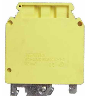
Terminal Width 15.2mm